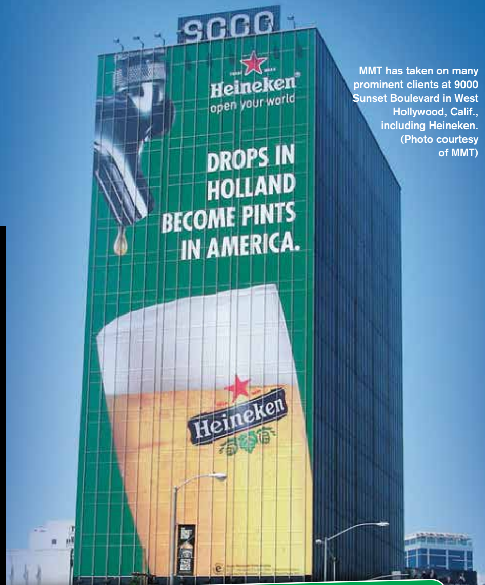
MMT has taken on many prominent clients at 9000 Sunset Boulevard in West Hollywood, Calif., including Heineken.