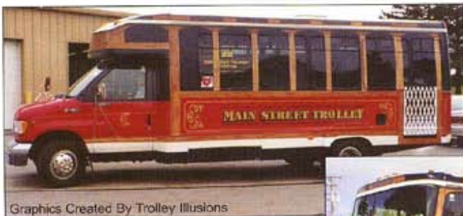
Graphics Created By Trolley Illusions