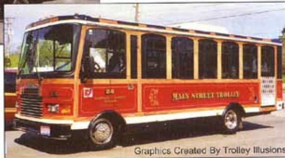
Graphics Created By Trolley Illusions

Bus wraps are a great way to increase you revenue and/or to promote your public image. Letting people know who you are and what you do is essential to staying competitive in any market, especially one as competitive as the bus industry. Using graphics can breathe new life into older buses and coaches and allow you to explore new revenue streams. The potential return on investment is high and you have the added benefit of being able to enjoy one very cool looking fleet!