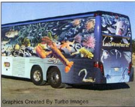
Graphics Created By Turbo Images