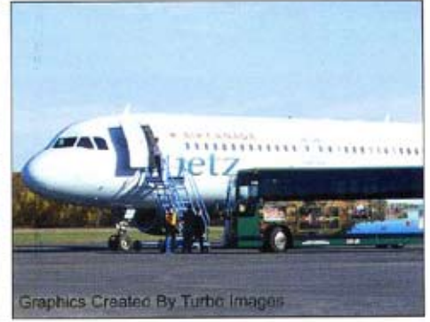
Graphics Created By Turbo Images

vinyl graphics to the exterior. These graphics make an average bus look more like an authentic trolley, complete with wood paneling and window treatments. The graphics are so detailed that people have attempted to open the gate, which of course does not exist!