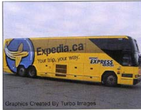
Graphics Created By Turbo Images